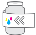
Print & Apply